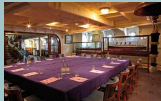
THE MODEL ROOM