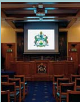
THE COURT ROOM