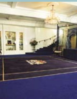
THE RECEPTION ROOM

An exceptionally adaptable traditional and stylish venue