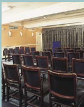
THE TAURUS SUITE