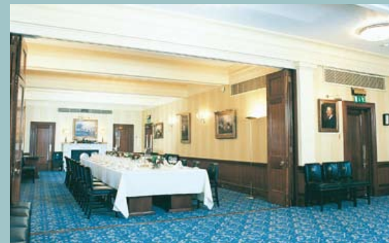
THE COURT SUITE

Butchers' Hall is the ideal location for companies or individuals wishing to entertain in style.