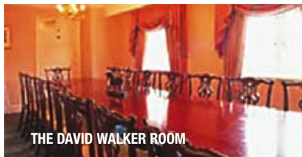
THE DAVID WALKER ROOM

Butchers' Hall is still closely associated with the Meat Industry and is suitably located in historic and vibrant Smithfield close to both St Paul's and the Barbican.