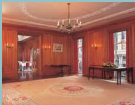
THE COURT ROOM