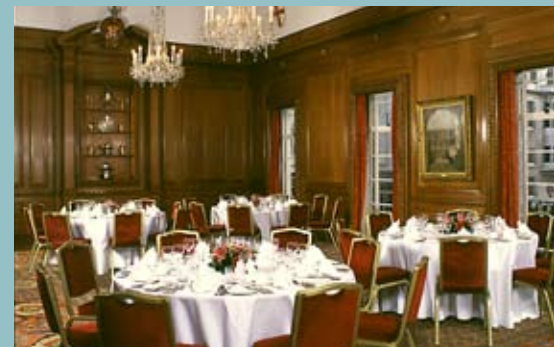
THE LIVERY HALL