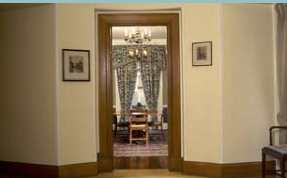
THE COMMITTEE ROOM

A warm and inviting centrally located venue